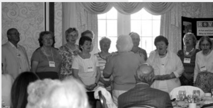
(Above) RSVP's Guys N' Gals Glee Club performs the National Anthem

RSVP would like to recognize the generous support of event sponsors: Citadel Bank for their support and gift movie basket and Silver Tone Med Plans. Donations of exciting gift baskets from; Brandywine Convention & Visitors Bureau, Tyler Arboretum and Tavoli Restaurant.