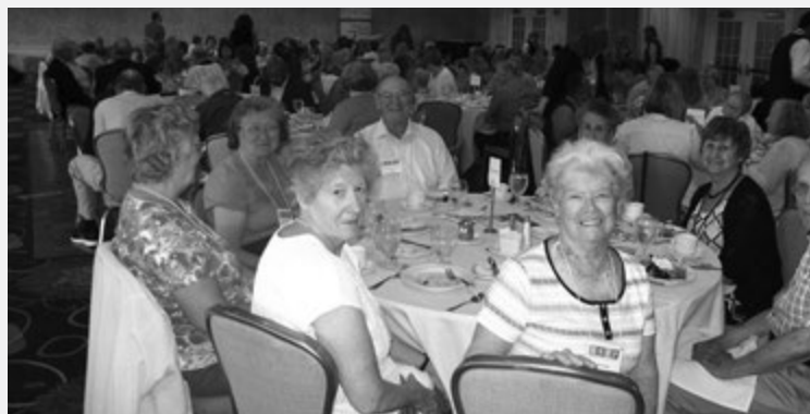
(Below) RSVP volunteers enjoy an afternoon at Springfield Country Club