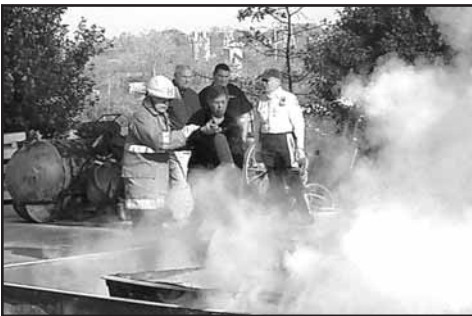
Volunteers receive fire extinguisher training

RSVP RESPONSE volunteers also collect deactivated cell phones and equip them with 911-dialing capability so that low-income seniors who live alone can stay in touch during an emergency. To date, more than 200 phones have been distributed. We are always accepting cell phone donations. For more details about RESPONSE and how you might become a volunteer, please call RSVP program coordinator Ruth Saks at (610) 834-1040 ext. 28.